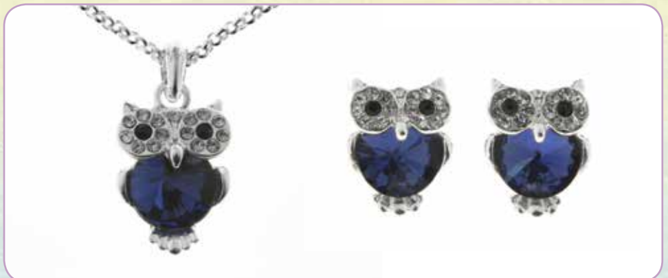
INEC2939 & IEAR300A