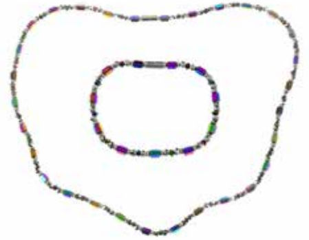
IEMH0140 (Necklace) & IEMH0138