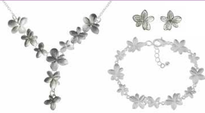
INEC3628, IEAR510 & IBRA1112