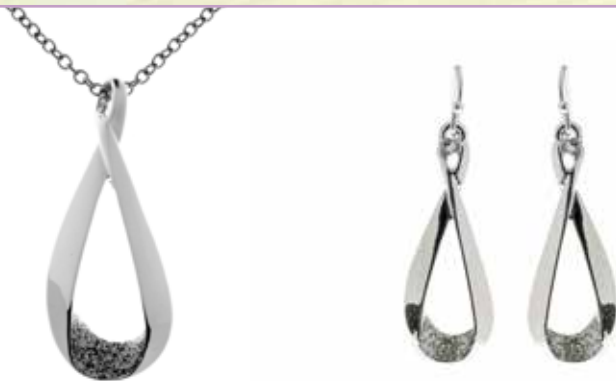
INEC3506 & IEAR505