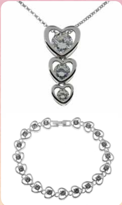
INEC3533 & IBRA1082