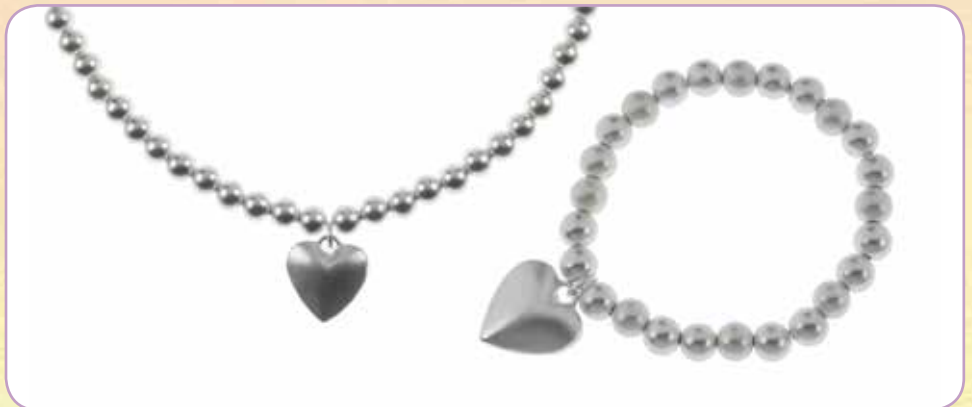
INEC3626 & IBRA1109