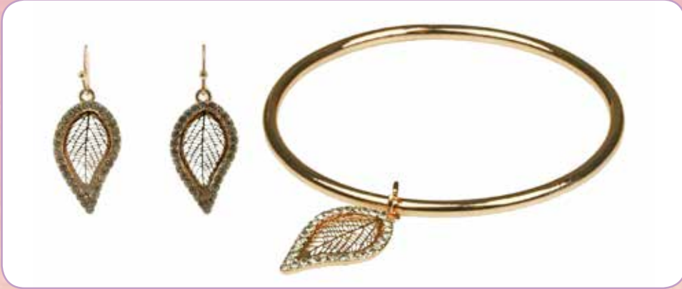
IBAN1344 & IEAR417