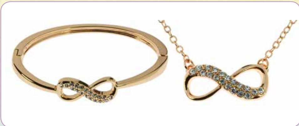
IBAN1401 & INEC3605