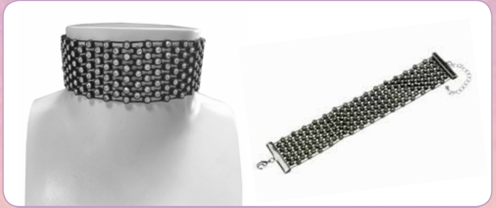
INEC3573 & IBRA1092