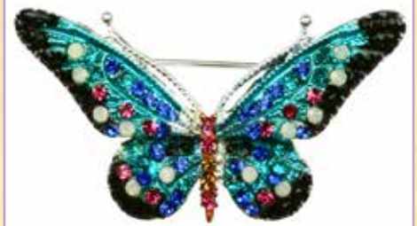
IBRO0871 & IEAR498