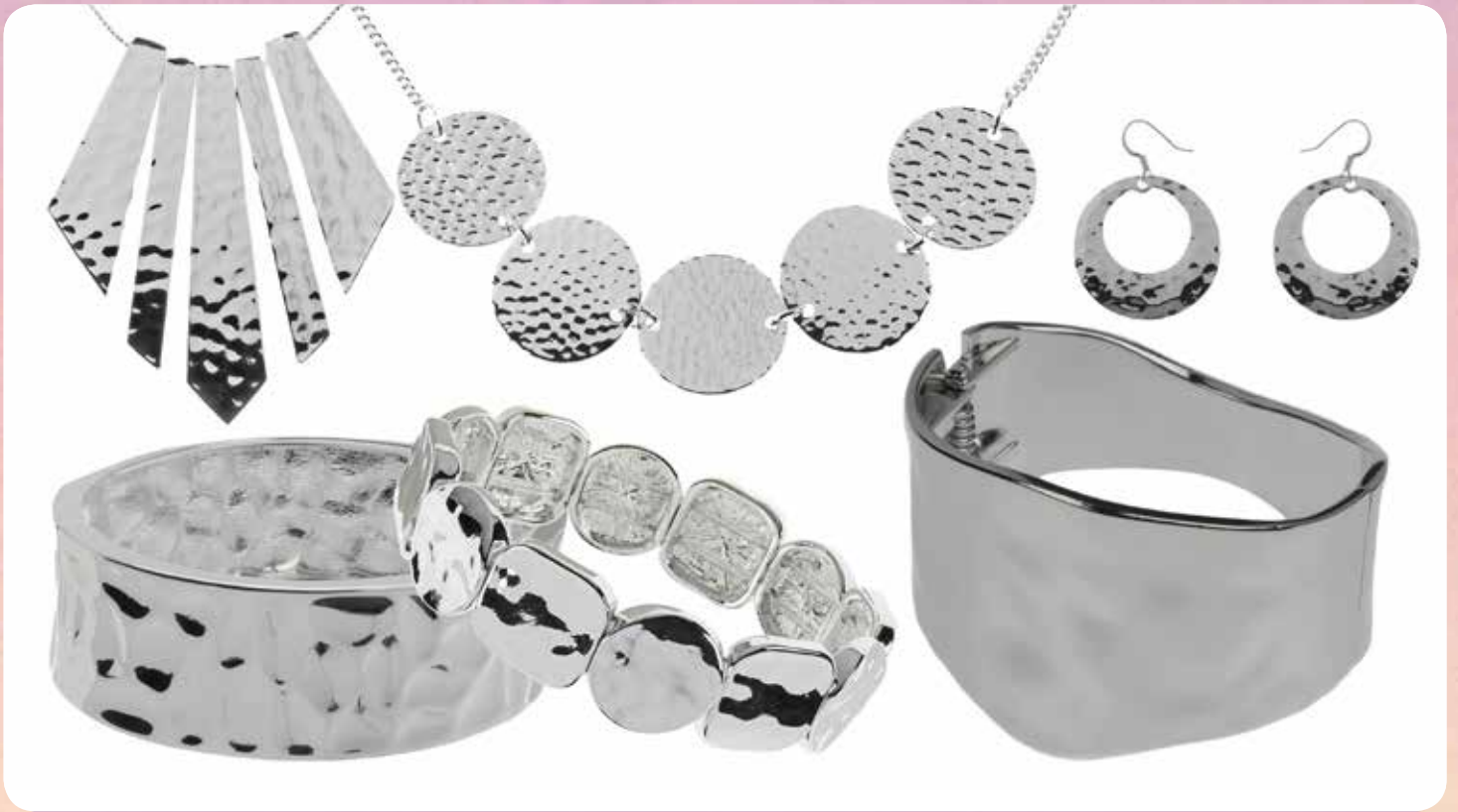
Clockwise: INEC3632, INEC3597, IEAR515, IBAN1433, IBAN1429 & IBAN1426