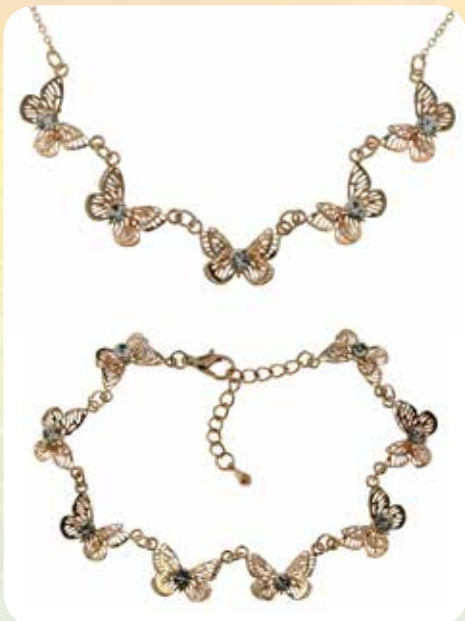
INEC3508 & IBRA1085