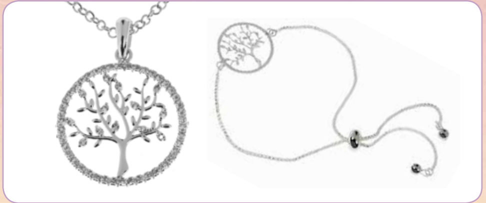
INEC3608 & IBRA1108