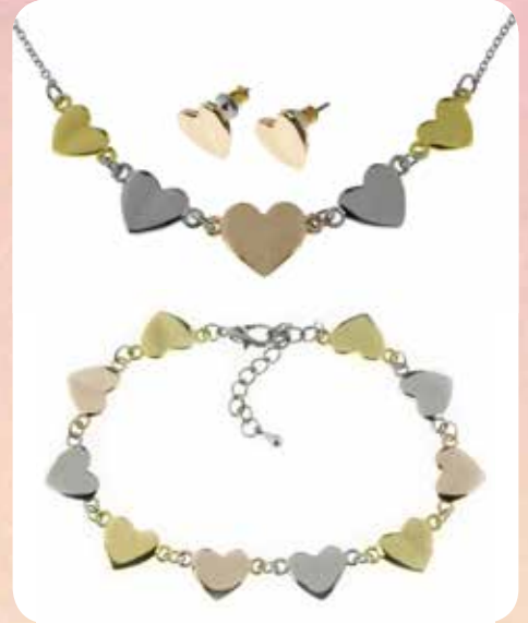
INEC3479 & IBRA1065A