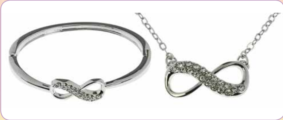
IBAN1397 & INEC3592