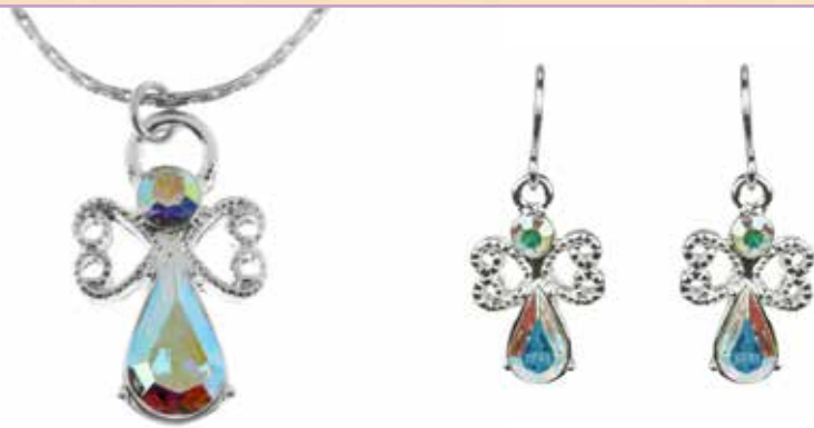
INEC3284A & IEAR484