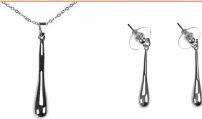
INEC3031A & IEAR324